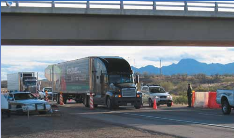
MicroSearch® G3 detects unauthorized individuals hiding in vehicles and containers.