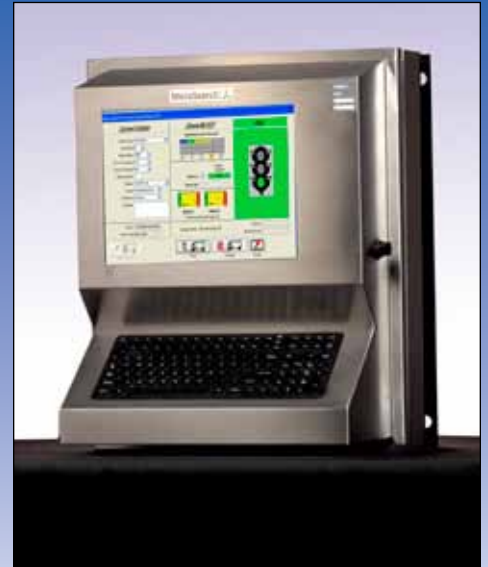
MicroSearch G3 industrial workstation.