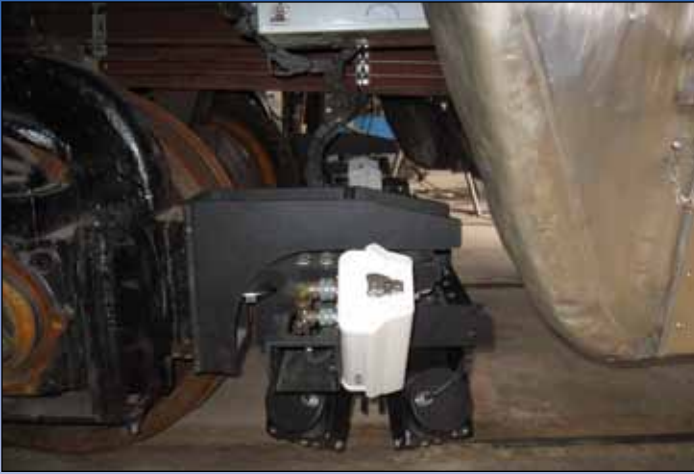
ENSCO's track imaging systems can be installed on full-sized track inspection cars.