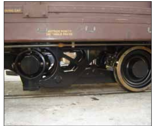
Deployable Gage Restraint Measurement System.

The highest quality track measurement systems using technologies refined through daily operational use and backed by a 40-year record of industry excellence