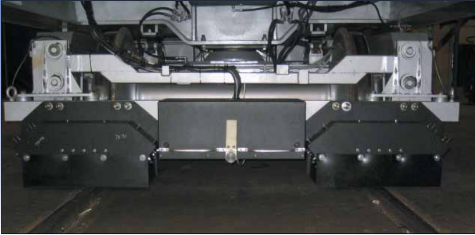
Track Geometry and Rail Profile Measurement System.

E NSCO, Inc. has the largest installed base of track measuring and imaging systems in North America and is recognized around the world as a leader in the supply of track evaluation systems. ENSCO understands the needs of rail customers and provides production worthy solutions that deliver both safety and economic benefits. ENSCO's 40 years of railway engineering experience assures that customers will receive the best possible measurement technology and technical support available. ENSCO's track measurement systems are based on a modular approach and scalable architecture to support a variety of measurement and imaging systems on a track recording vehicle.