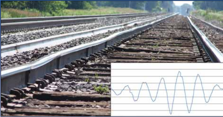
V/TI exceptions can be correlated to specific track conditions.