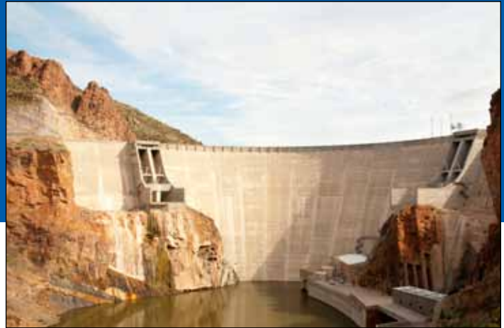
ENSCO has conducted more than 300 assessments for U.S. and allied critical infrastructure.

Since 1996, ENSCO has lead an interagency Red Team to conduct all-source assessments aimed at identifying critical vulnerabilities within the U.S. nuclear command and control architecture. This is done by emulating foreign intelligence services or terrorist organizations operating against national assets.